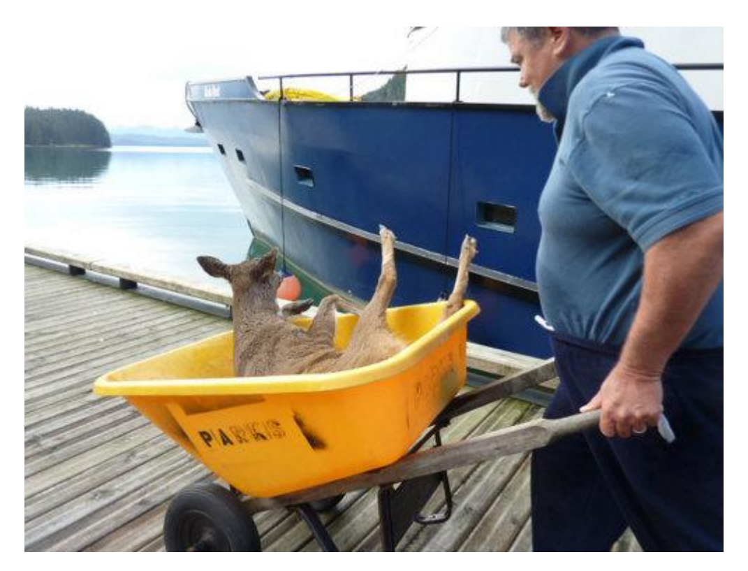
This is me carrying the little guy.

"This is a picture I took of the rescued bucks on the back of my boat, the Alaska Quest. We headed for Taku Harbour. Once we reached the dock, the first buck that we had been pulled from the water hopped onto the dock, looked back as if to say 'thank you' and disappeared into the forest. After a bit of prodding and assistance, two more followed, but the smallest deer needed a little more help.